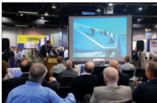
The exhibit included videos on the latest roofing technology.