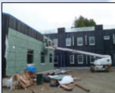
College of Marin Science Building has partial installation of Trespa panels on the left-hand side.