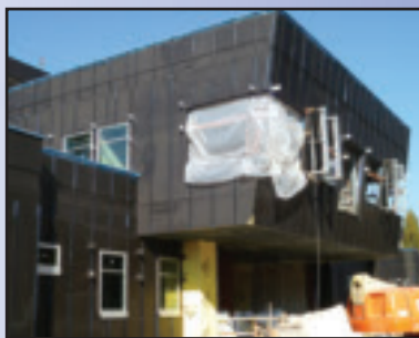
The front entrance to the Science Building project at the College of Marin. The exterior of the building was sprayed by our roofers with Henry Air-Bloc 33 as an air barrier. Vertical bars were then attached to the building to hang the Trespa panels on.

Union roofers and waterproofers in California and across the nation are proving that their skills and knowledge are at the forefront of the air barrier industry. Don't let the industry forget this!