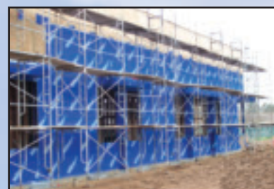
The blue material is Henry Blueskin air barrier.