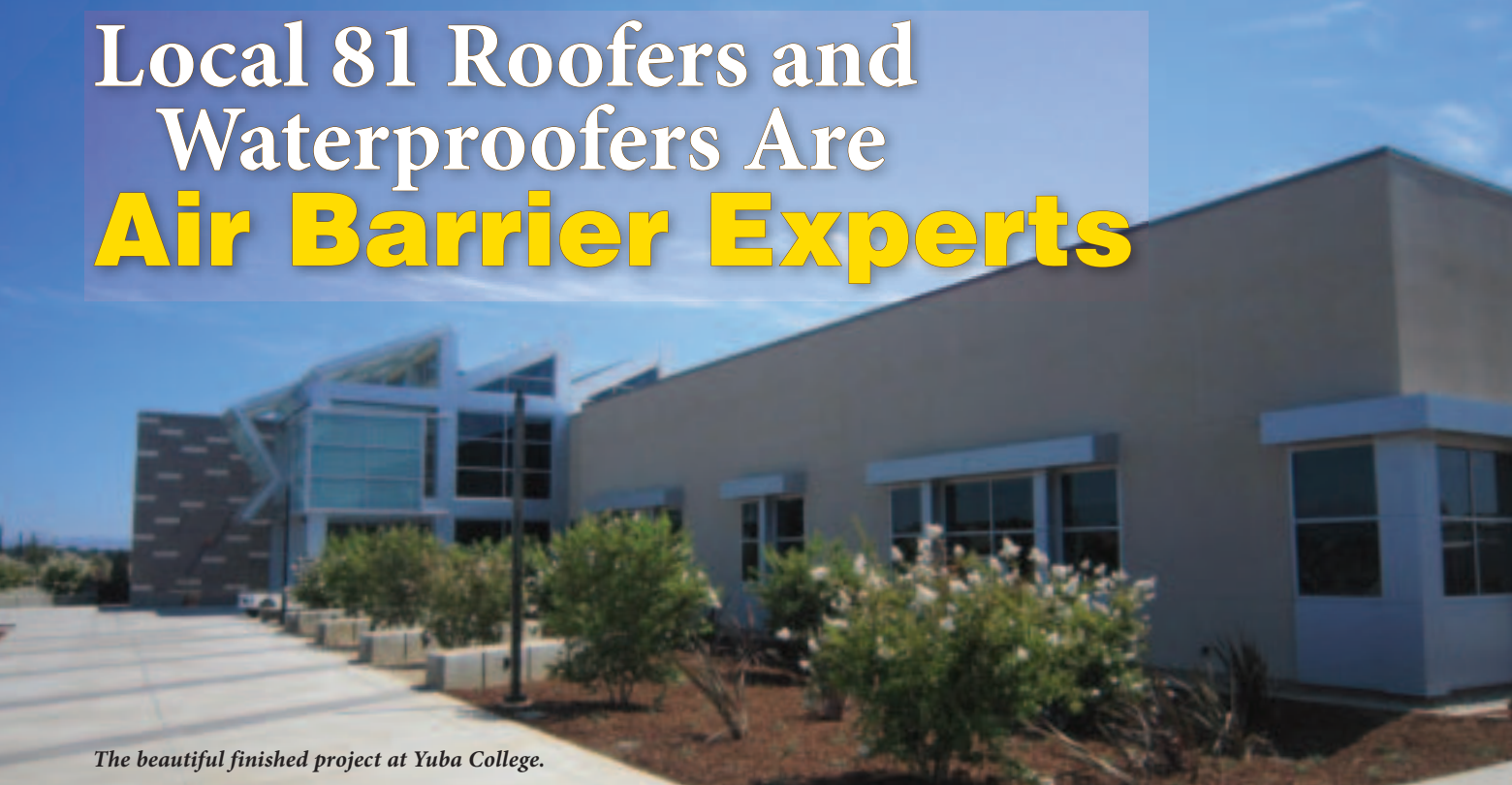
The beautiful finished project at Yuba College.

T he College of Marin and Yuba College have more in common than just being institutions of higher education in Northern California. Both campuses have recently added buildings that include air barrier systems installed by Roofers and Waterproofers Local 81 in Oakland, CA.