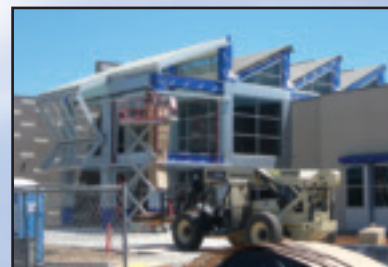
A new building at Yuba College receives air barrier application by Local 81 roofers and waterproofers.